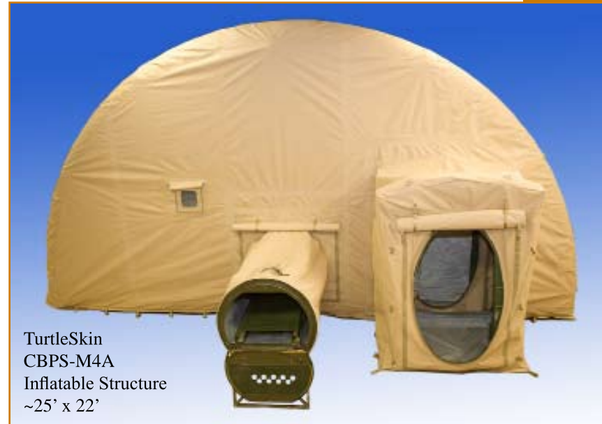
TurtleSkin CBPS-M4A Inflatable Structure ~25' x 22'