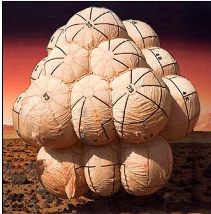
Mars air bags made with fabric manufactured by Warwick Mills

Warwick developed the critical air bag fabric for NASA's exploration missions to Mars, including the successful Pathfinder, Spirit, and Opportunity missions.